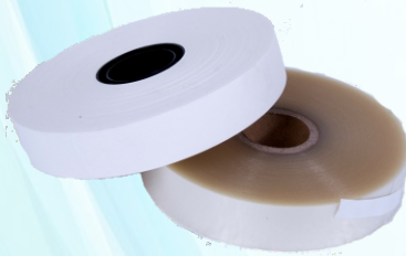
PAPER/POLYMER BANDING ROLL