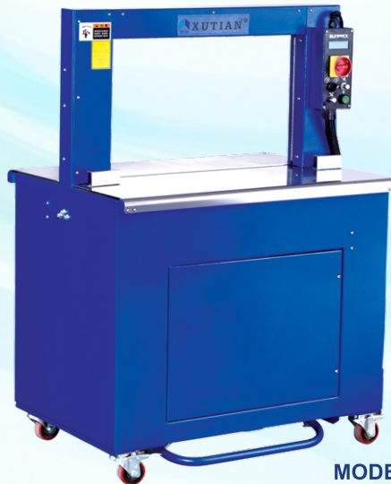
MODEL : Q80D