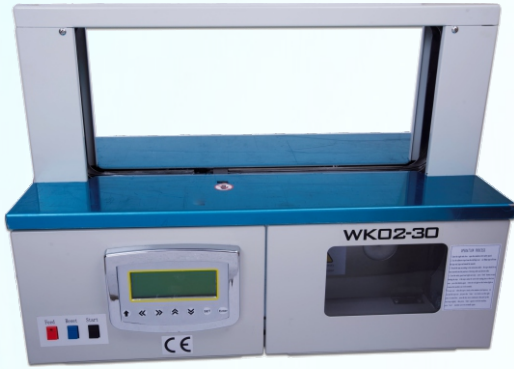
MODEL : WK02-30