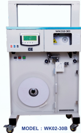
MODEL : WK02-30B