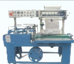
FULLY AUTO L SEALER