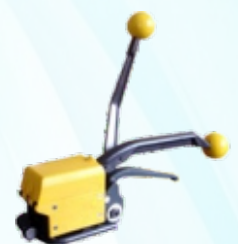
MODEL : A-333