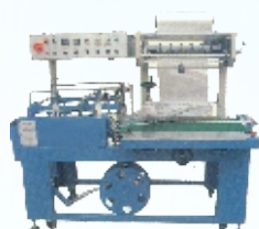
FULLY AUTO L SEALER