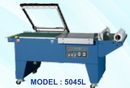
MODEL : 5045L