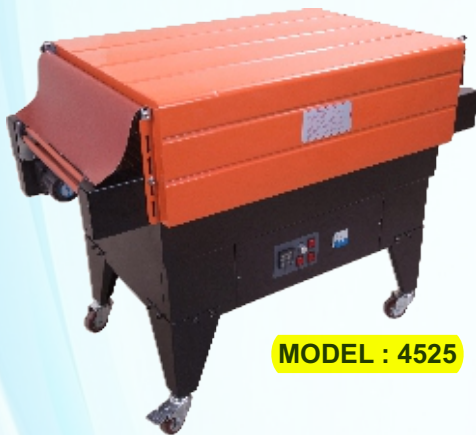
MODEL : 4525