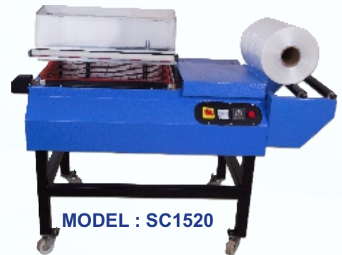
MODEL : SC1520