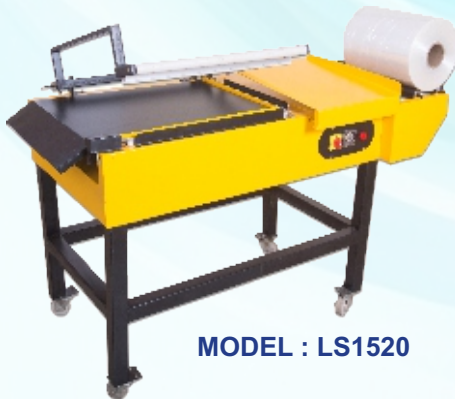
MODEL : LS1520